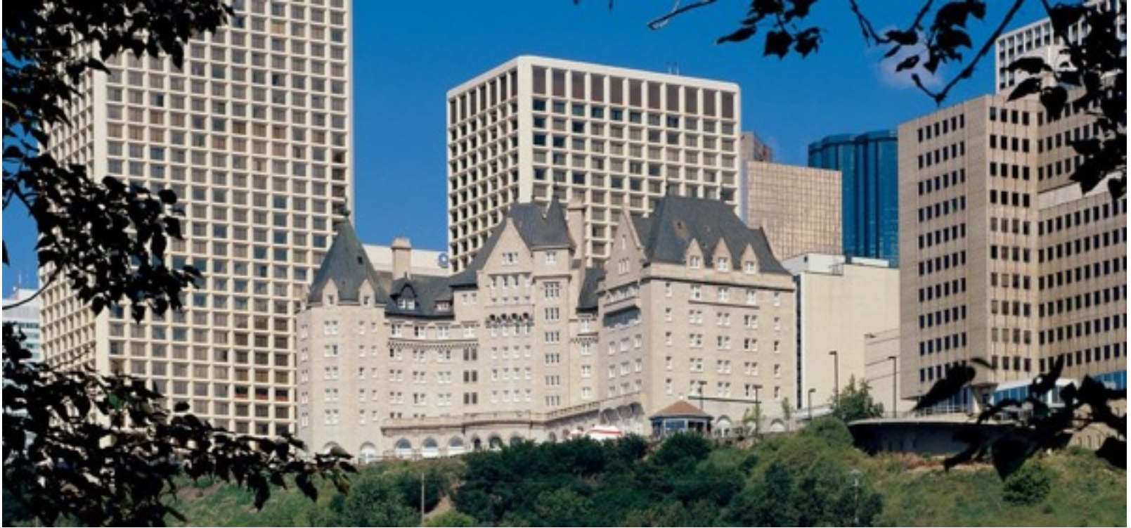
Edmonton's Fairmont Hotel MacDonald

Edmonton's Blue Plate Diner, holding court on downtown's 104th Street promenade, serves uplifting diner cuisine including an elk & bison burger, vegetarian options, and a Kentucky Hot Brown (turkey) Sandwich. This cozy joint with high ceilings is a member of eatlocalfirst.com .