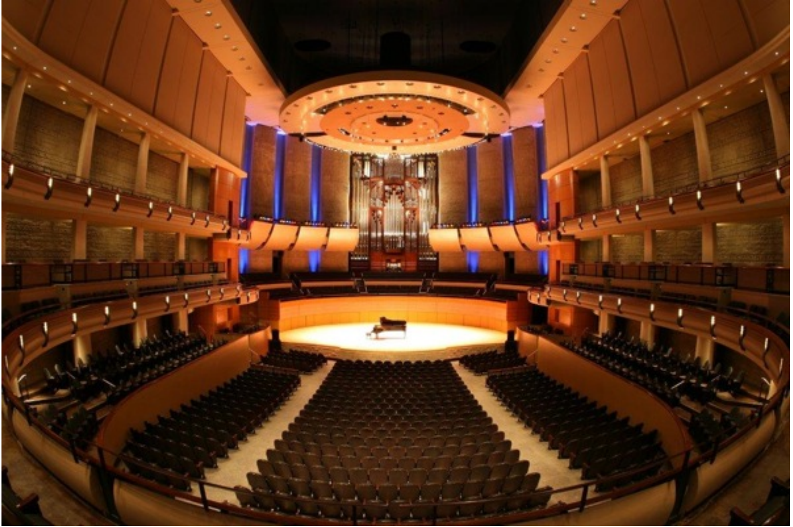
Edmonton's Winspear Centre

Culture thrives here. Although across-the-river Old Strathcona seems get all the mojo buzz, downtown Edmonton teems with world class performance spaces. The Citadel is a breathtaking complex of theaters, one a 700-seat state-of-the-art thrust stage. All of the Citadel's venues combined make it the busiest regional theater in Western Canada. citadeltheatre.com . The Winspear Centre's acoustically perfect balcony-flanked venue also showcases world-class music acts. winspearcentre.com . A sculpture itself when viewed from afar, the incredible Art Gallery of Alberta opened in 2010. It dazzles from inside and out. youraga.ca .