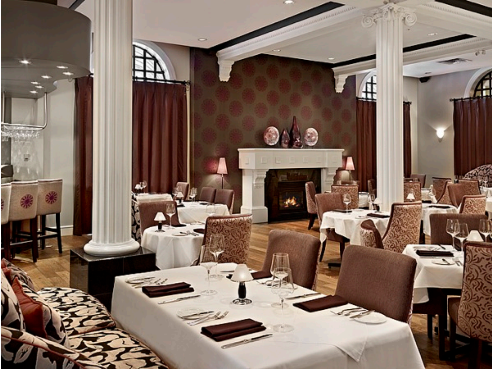
Madison's Grill—ground floor of The Union Bank Inn

For a taste of grand Canadian royalty consider the imposing, river valley-hugging Fairmont Hotel MacDonald. Sample this landmark on fairmont.com/macdonald-edmonton . The cheesy-but-fun Fantasyland Hotel, attached to the famed West Edmonton Mall, is themed by floor. Choices include Hollywood, Roman, and Tropical—there's even a few igloo-themed rooms with bunk beds. The mall's mammoth indoor rollercoaster is a savage neck-twister. fantasylandhotel.com .