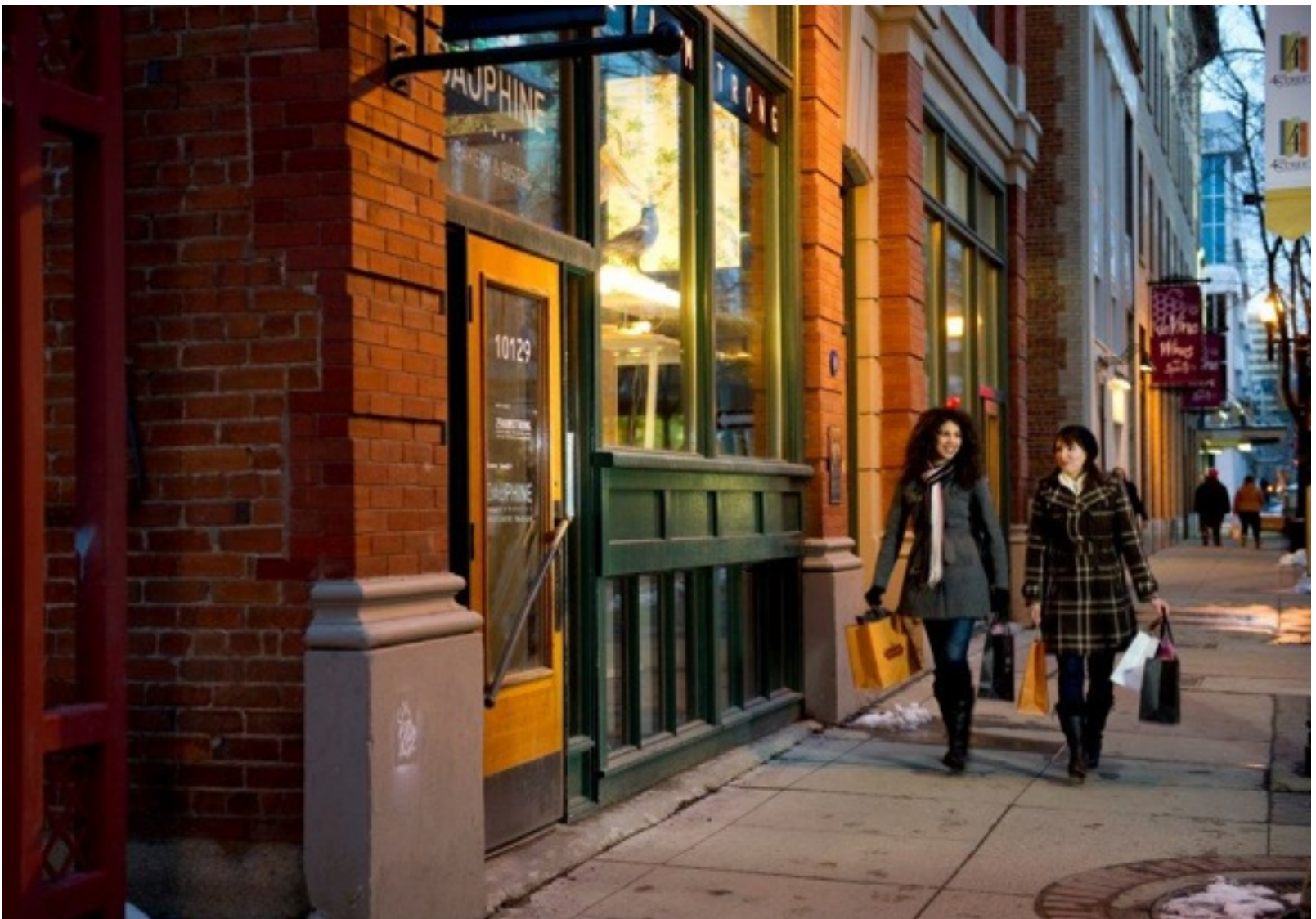
104th Street Promenade—home of the Blue Plate Diner

Edmonton's Blue Plate Diner, holding court on downtown's 104th Street promenade, serves uplifting diner cuisine including an elk & bison burger, vegetarian options, and a Kentucky Hot Brown (turkey) Sandwich. This cozy joint with high ceilings is a member of eatlocalfirst.com .