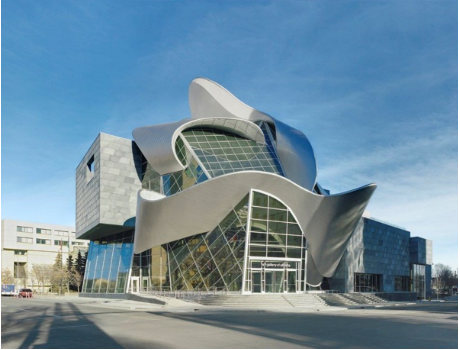
Art Gallery of Alberta

The Union Bank Inn, a resurrected old-style bank that melds bold Modern Renaissance—imagine swanky 1911—and contemporary design. The goose down bedding, fireplace, and fleece robe waiting in your room add to the understated elegance. Sturdy like an armory, the 14 vintage rooms have different themes each individually overseen by some of Edmonton's finest interior designers. An adjacent wing providing business-style accommodation makes 34 rooms total. People make a place and their warm staff completes the luxurious Inn experience. The ground floor of the hotel features Madison's Grill—fine dining sourcing local options—and the adjoining wine cellar-esque Vintage Room. unionbankinn.com .