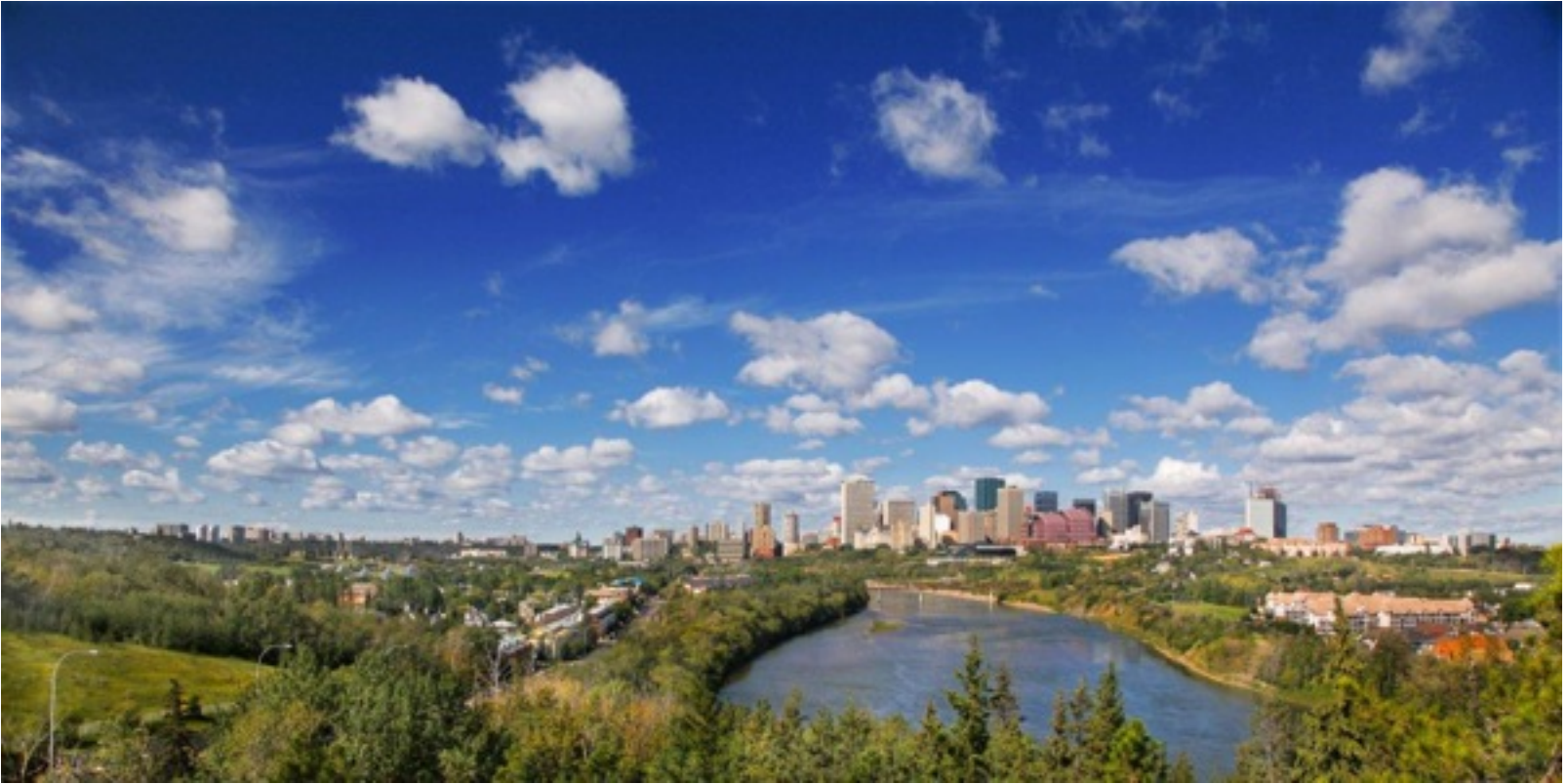
Edmonton skyline along North Saskatchewan River valley